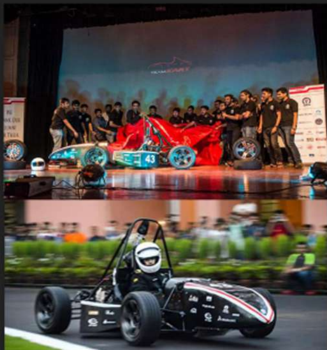
Unleash event of K3 at IIT Kharagpur followed by a run in campus.