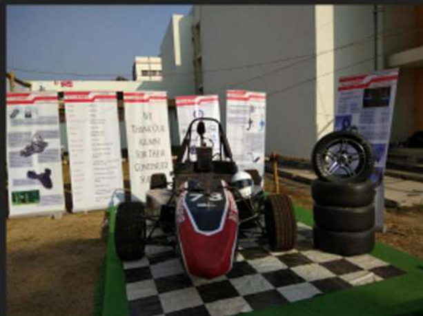
Our car K3 displayed at auto expo during Kshitij 2018

We conduct a workshop in our annual techno-management fest of IIT Kharagpur. Kshitij is the largest fest of its kind in Asia. It receives over 50,000 outstation participants. We also present our car in front of the participants from various part of the country. The event also saw the presence of eminent personalities, who were here as guest lecturers, including renowned scientists, technocrats, journalists and business tycoons.