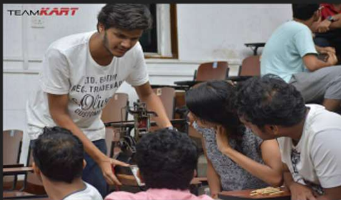
Our team member demonstrating single cylinder engine at kharagpur workshop.