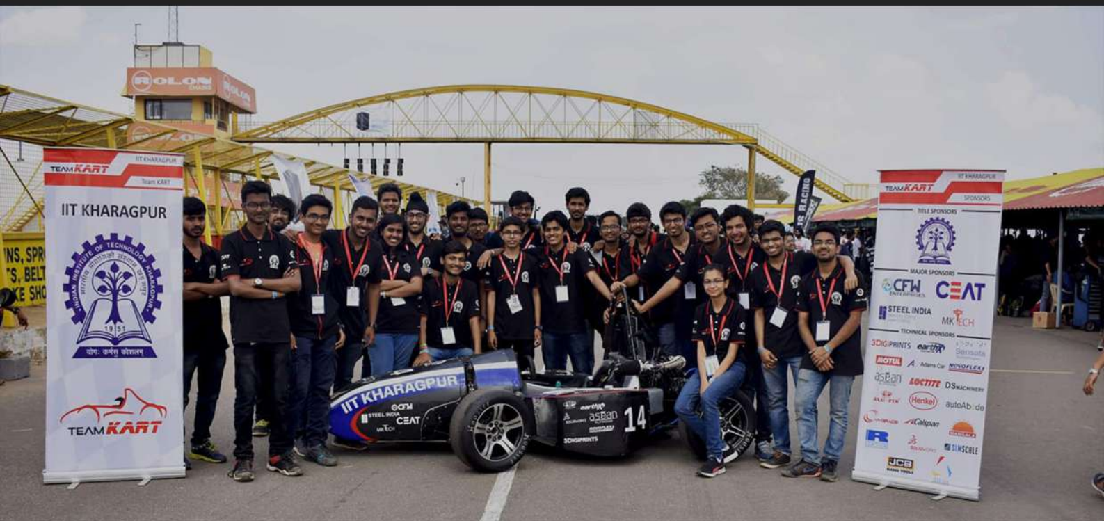
The team with K4 (2019)