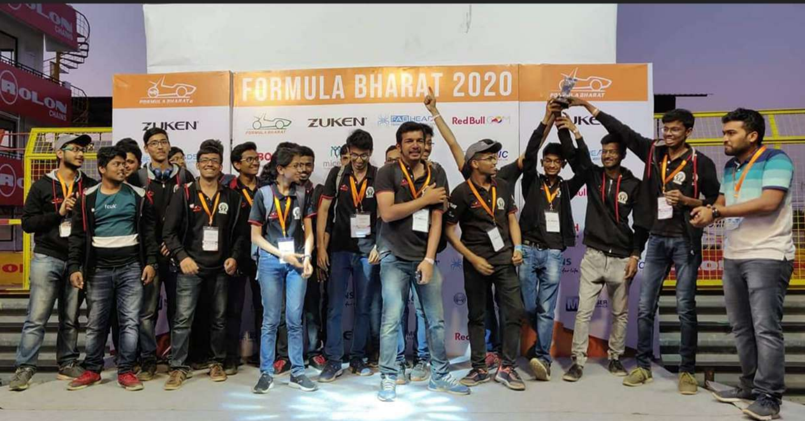
The team at Formula Bharat 2020