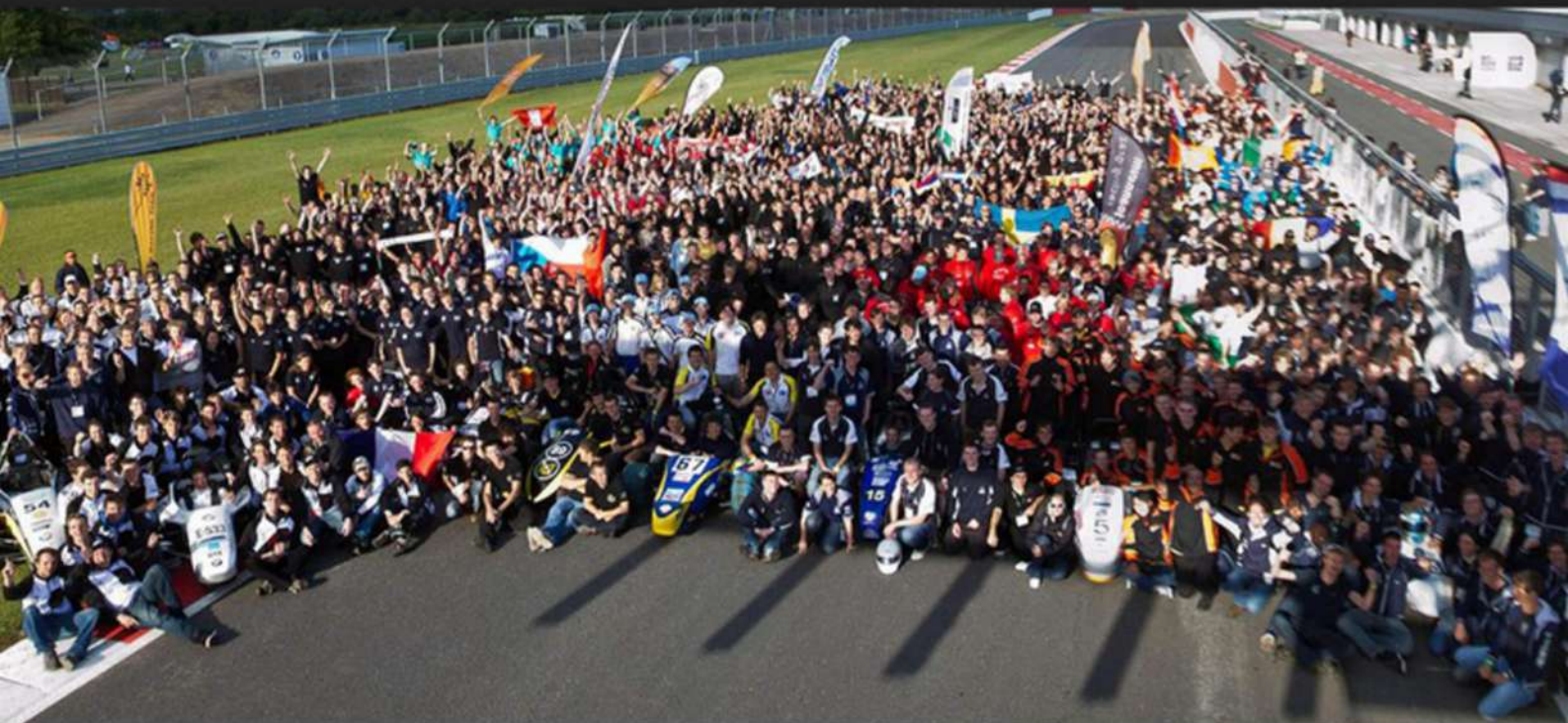
The participants at Formula Student UK, Silverstone. 2014