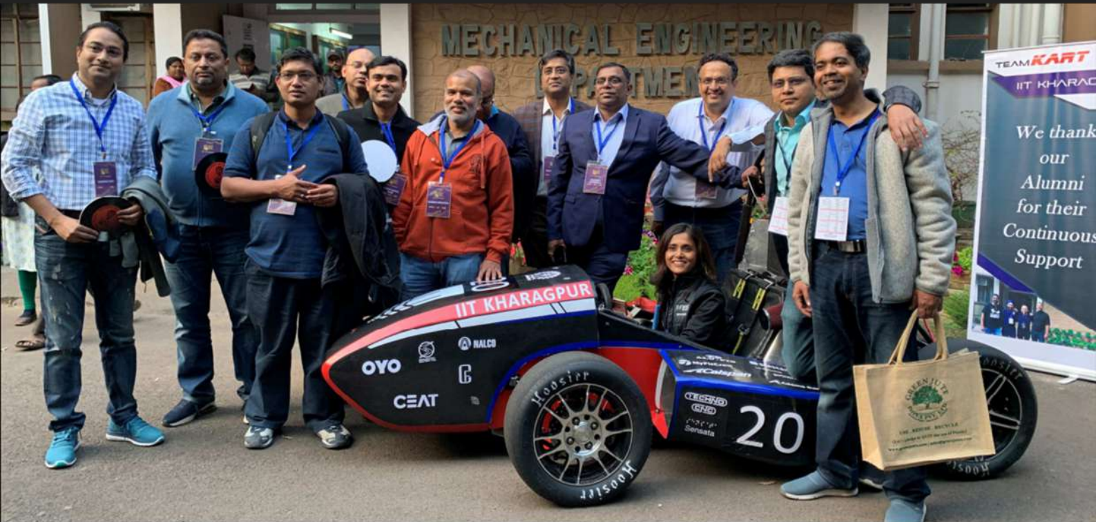
Annual Alumni meet with the K5

TeamKART annually hosts a show at this meet where the car is showcased. It is followed by a photo session with the car and interaction sessions with the team. This has become a major event which draws the attention of all the visiting alumni.