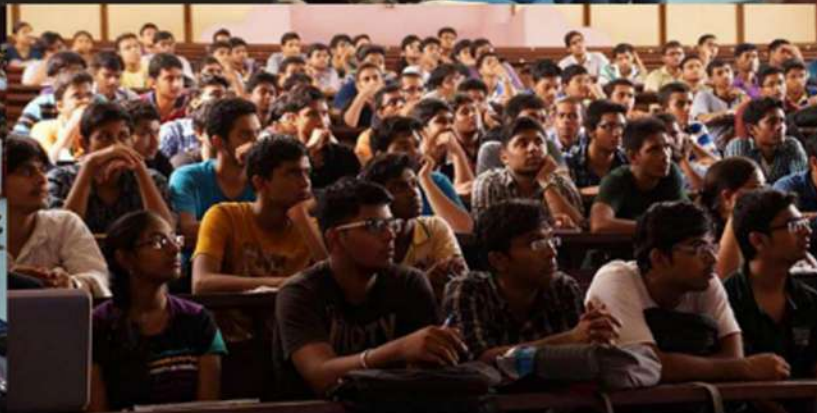
Participants at the various workshops