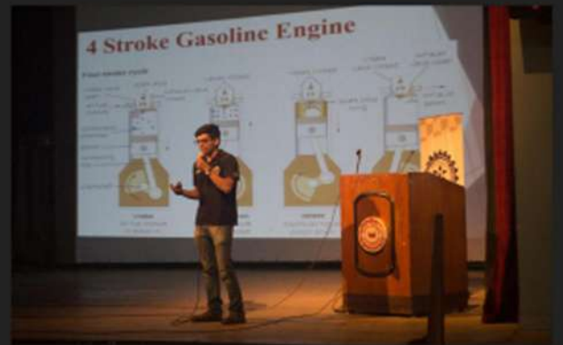
Our powertrain head teaching 4 stroke combustion cycle at kolkata workshop